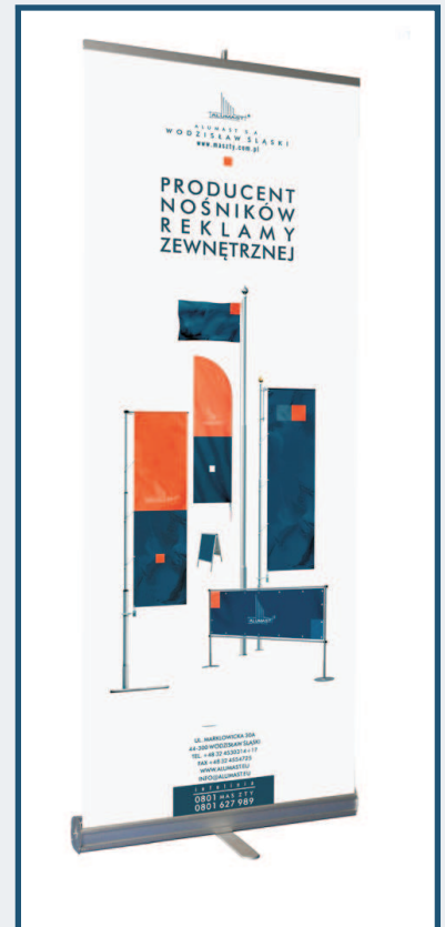
Roll Up ECO

◀ 4 cm, bottom margin - area which is unseen